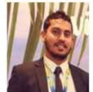
Yamin PR and Marketing