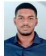
Raif Corporate Affairs